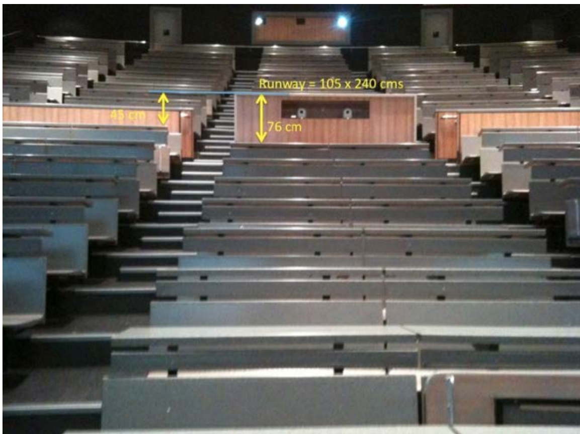
Figure 2: View of Launch Table from Front of Aerodrome